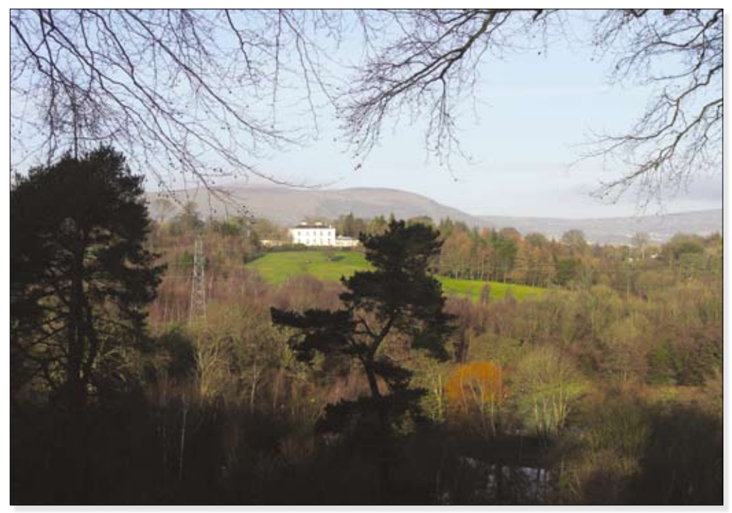
Barnett's Park from Terrace Hill

built; when there were several rings probably of wooden posts, around it. Other finds nearby indicate the area, Ballynahatty townland, was a centre for ritual activity at that time. You can walk round the top of the ring and get an impressive panorama of the Belfast Hills and surrounding countryside,